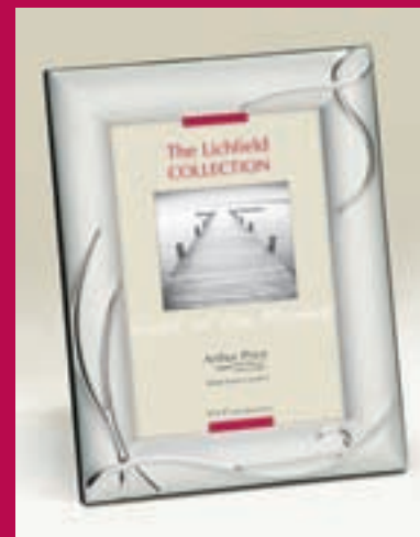
NEW Ripple 6402 4" x 6"