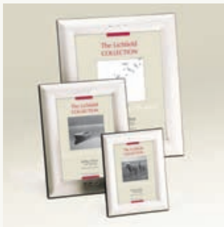
Chase 9503 3.5" x 5"

Indulge in the clean, fluid lines of our modern design classics