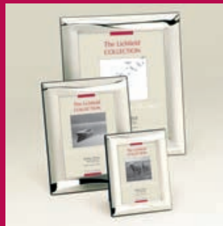
Trent 9403 3.5" x 5"