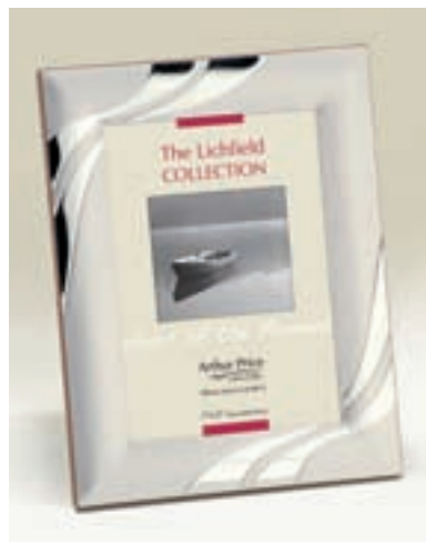
Mustique 8405 5" x 7"