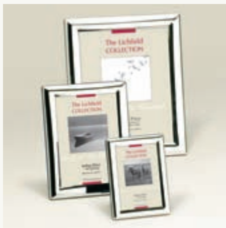
Oxford 9303 3.5" x 5"