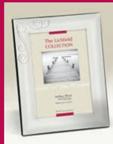
NEW Heart 6401 4" x 6"