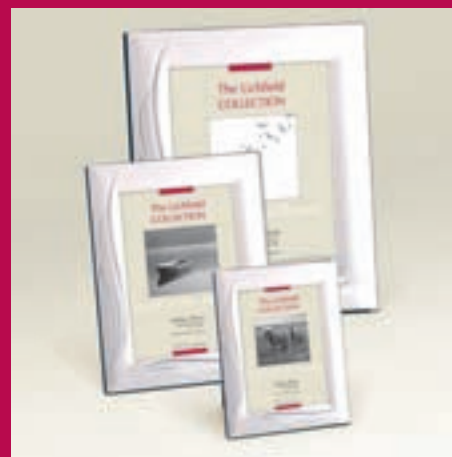
Weston 9703 3.5" x 5"