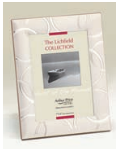
Drum 8505 5" x 7"