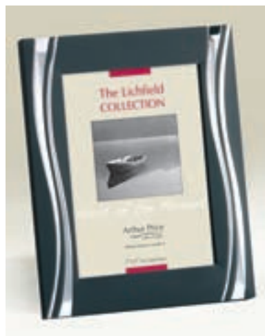
Obsidian Black photo frame with silver-plated waves 9605 5" x 7"